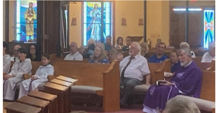
St. John Neumann Assembly Corporate Communion

Our Lady, Queen of the Knights, bless all the activities of our Order. Keep us true to our pledge, to extend the kingship of your divine son on earth. Through Your intercession, win for us the grace, ever to exemplify in our public and private lives, the virtues that should characterize those especially dedicated to the service of the heavenly court. Make us always aware that as your Knights, we are constantly observed, our faith judged, and our Order appreciated. Accept, O Mary, this renewed pledge of fealty and devotion, from Your Servants, the Knights of Columbus.